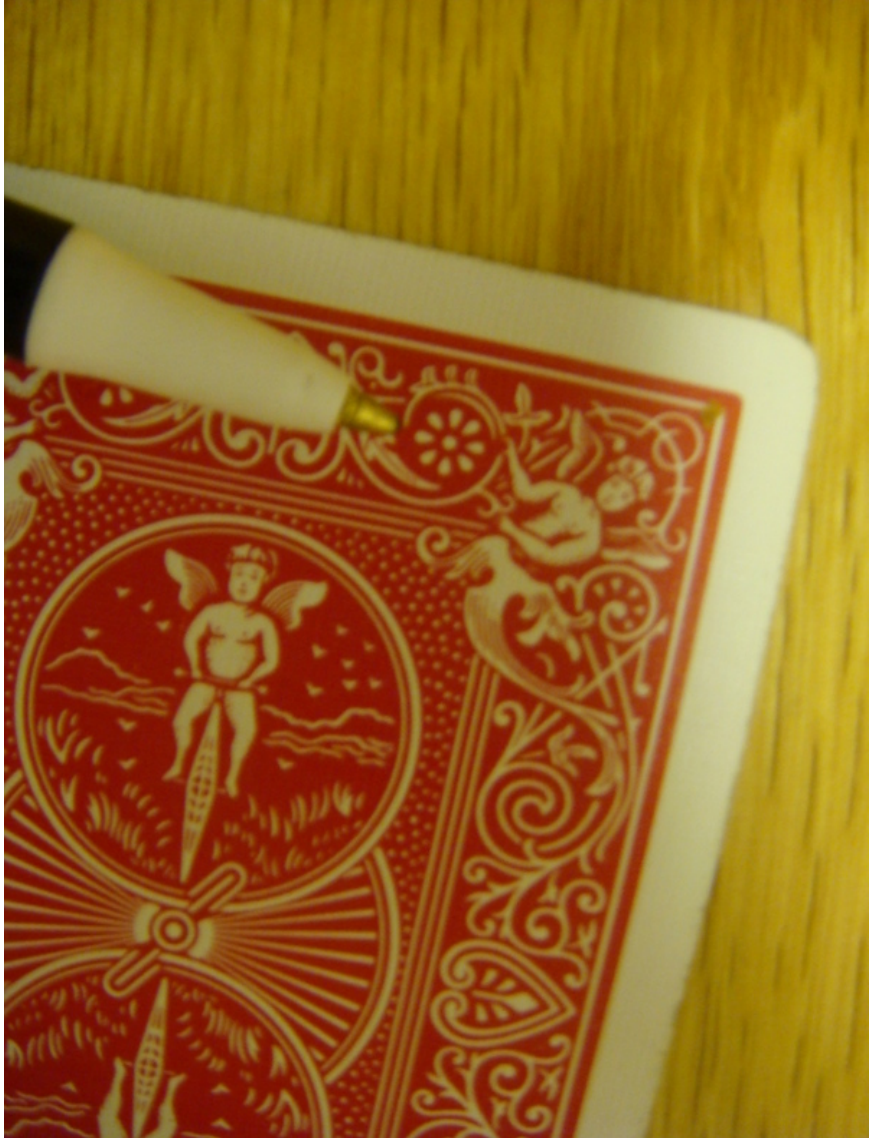
It is also a Spade designated by the full circle on the