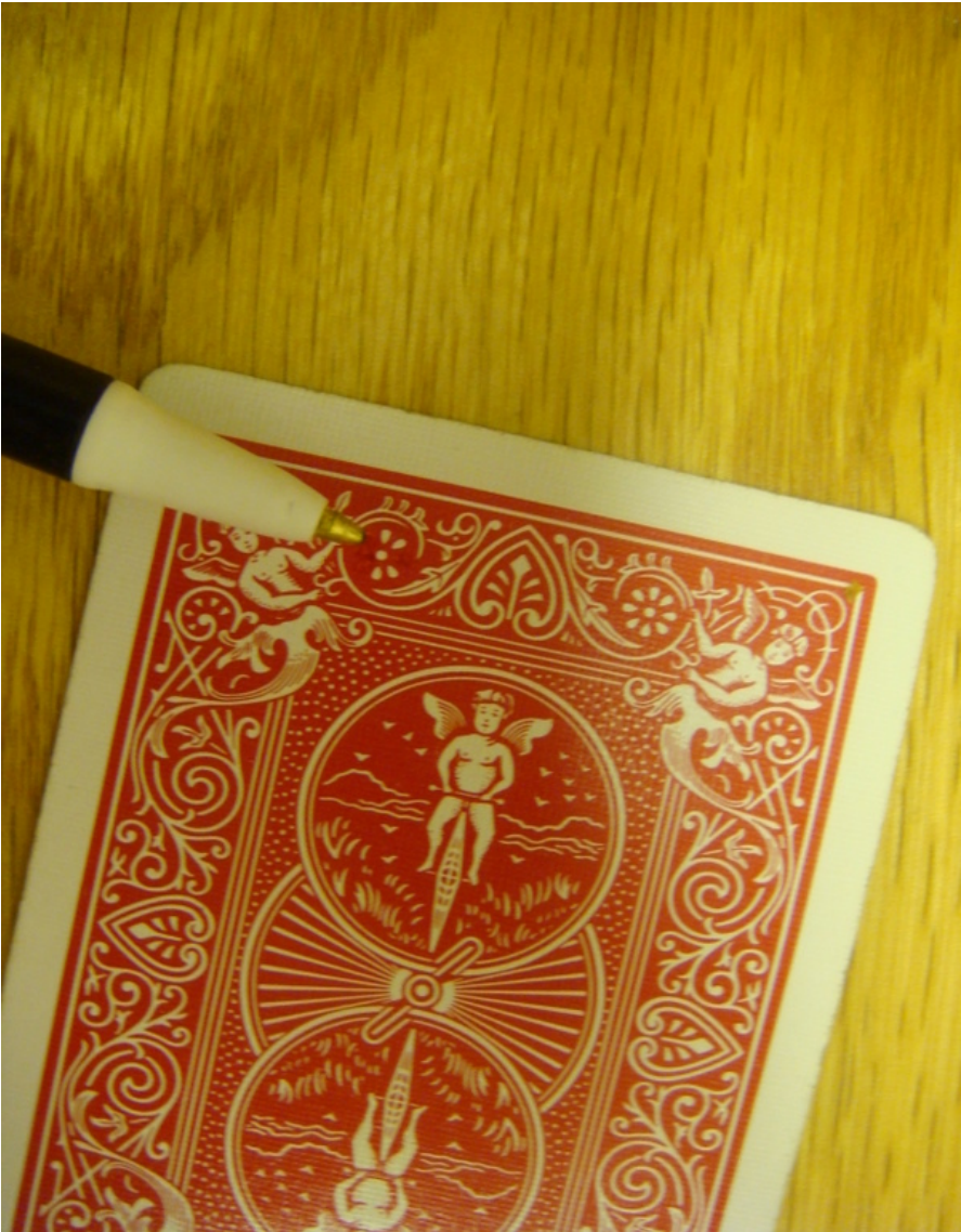
This card is a King represented by a K in the left corner right